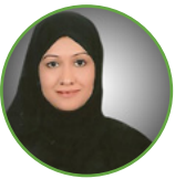
Noura Al Zamani Cultural Committee Chairperson